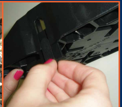
Insert locking cover