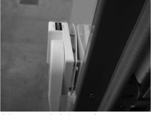
Mount and tighten 4 screws