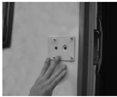
Mount inside backing plate and insert 4 screws